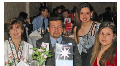
Certificate recipient (2nd left) & family at AGM