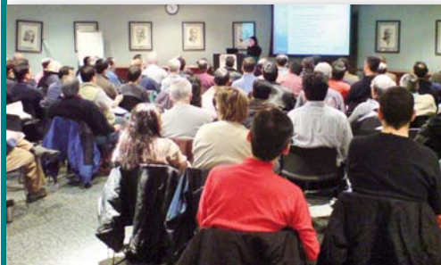
Markham Small Business Seminar at Markham City Centre